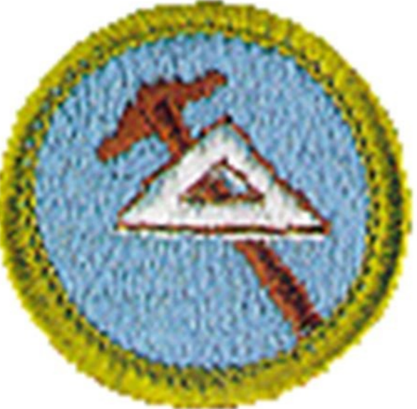
Landscape architecture merit badge requirements. Bsa landscape architecture merit badge worksheet.